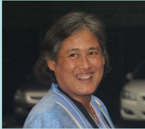
PATRON: HRH Princess MAHA CHAKRI SIRINDHORN